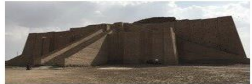
Examples of cradles of civilisation