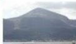
Slieve Donald, Northern Ireland