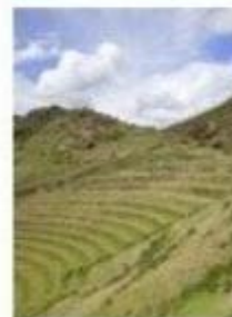
Terraced farming, Peru