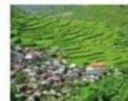
Rice fields, Philippines