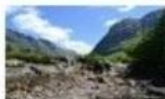
Ben Nevis, Scotland 1,345 m