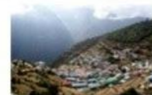
Village on the slope of the Himalayas