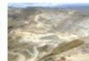
Copper and tin mines, Peru