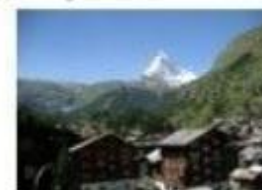
Hotels in the Alps for tourists