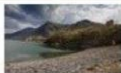
Snowdon, Wales 1,085m