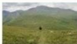
Scafell Pike, England 978m