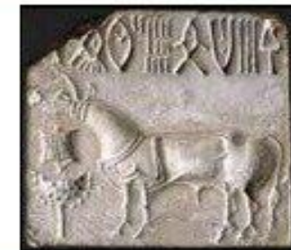
Indus Valley civilisations