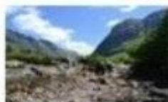
Ben Nevis, Scotland 1,345 m