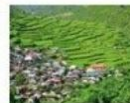
Rice fields, Philippines