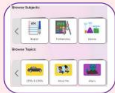
Subjects & Topics