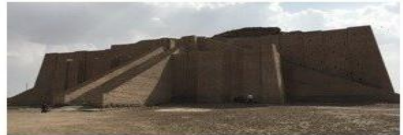
Examples of cradles of civilisation